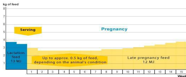
Figure 1: Feed curve during gestation